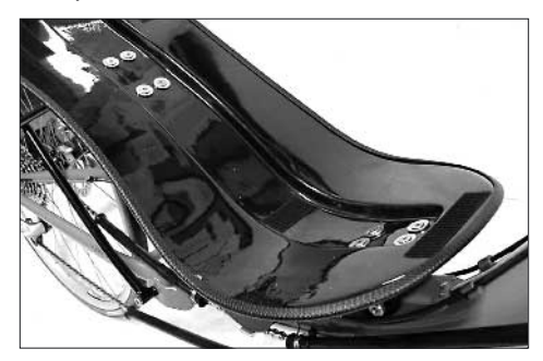
HP VELOTECHNIK's seats feature a special channel for the spine. You can individually adjust the padding.

You can alter the seat shape individually to match the shape of your back by adding foam material under the seat cushion. The seat has a special channel down the center for your spine with an extra layer of foam for the spine in the seat form. Thus, the spinal processi of the vertebrae are comfortably padded. Some people have single vertebrae that stick out particularly. If your spine is like this you can cut out some padding material at the respective spot in the spine channel.